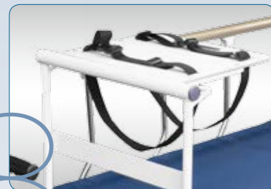
Optional equip with foldable monitor/ defibrillator tray