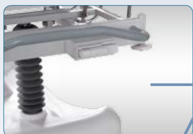
Manual crank for knee gatch