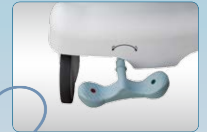
2 Central brake pedal at dual ends