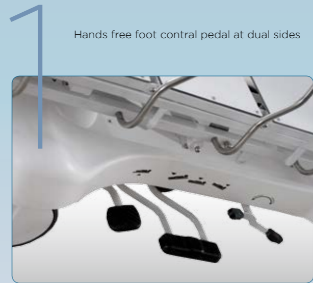
1 Hands free foot contral pedal at dual sides