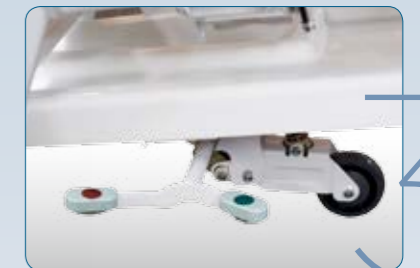
3 Directional steering wheel, shock-proof Foot control pedal at dual sides