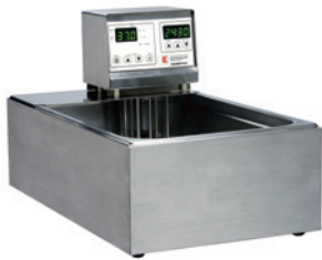
All Stainless Steel